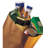
› General purpose