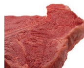
› Food processing

Our extensive experience in a variety of industries includes up-to-date knowledge of your ever-changing needs. At Continental ContiTech, we make it a priority to understand, and quickly respond, to the realities of your industry, whatever they may be.