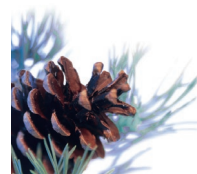
› Wood products