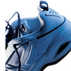
› Health and fitness